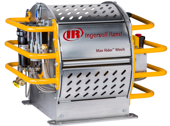
MR150 Man Rider® Winch

Ingersoll Rand recommends an Encompass Certification be performed every 3 years of operation for all man rider winches due to the critical nature of the product. The Encompass Rectification program is available for the LS2150, FA150 and MR150 winch models.